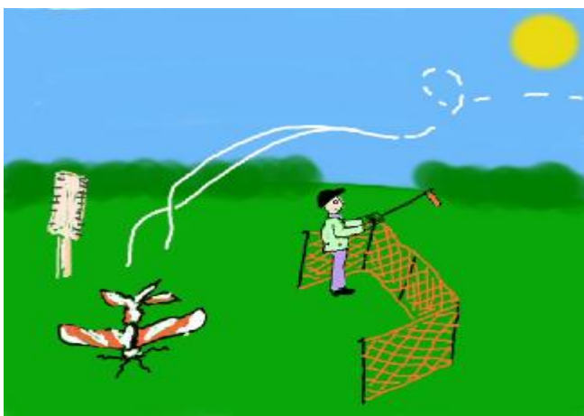
I think I've lost it !!