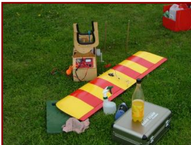
Caption Competition for picture titled where's Dave?